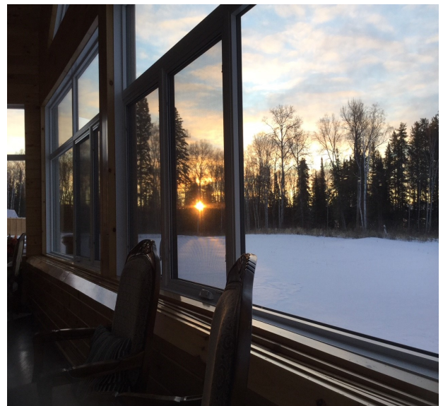
Lac des Mille Lacs First Nation Education Centre