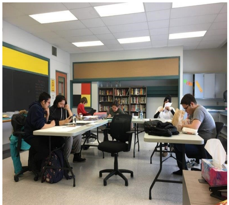
Lac des Mille Lacs First Nation Education Centre